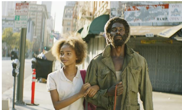
PRINCESS OF THE ROW

STARS EDI GATHEGI AND TAYLER BUCK SCHEDULED TO ATTEND SCREENING AND OPENING NIGHT PARTY ON OCTOBER 24